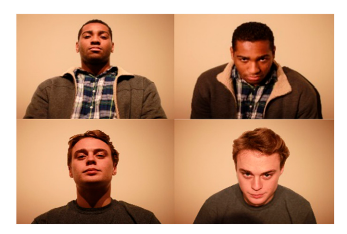
Fig. 3. Two of the 16 male students whose photographs were used in study 2. The men in the photographs on the left (looking down) were perceived as taller than the same men in the photographs on the right (looking up).

BaBT. Participants answered questions adapted from the General Social Survey (gss.norc.org/). We used these questions because they are less confounded with political beliefs than other scales (43) and directly target stereotypes of Black threat. Participants provided their attitudes toward Black, Hispanic, and White people on seven-point bipolar scales for "nonviolent/violent," "nonthreatening/threatening," "nonaggressive/aggressive," and "not dangerous/dangerous." Questions about Hispanic